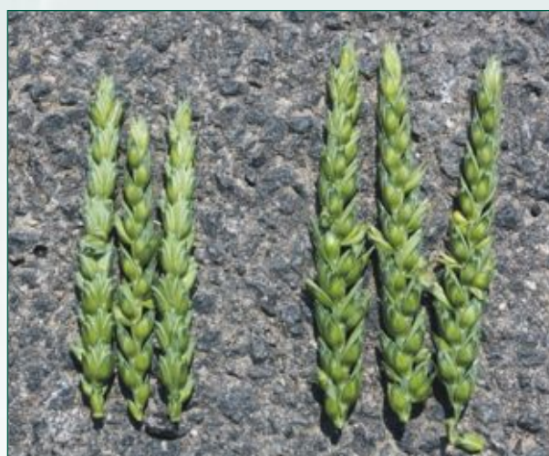
No TwinN, 180 kgN/ha TwinN + 90 kgN/ha